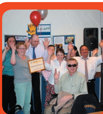
LEAPS and BLinD Volunteers (left) and The Chyrelle Addams Breast Cancer Appeal Trust (below)

Volunteers from each group spoke about what they personally gain from volunteering and what they liked about the group they volunteer for, highlighting how important it is for groups to look after their volunteers.